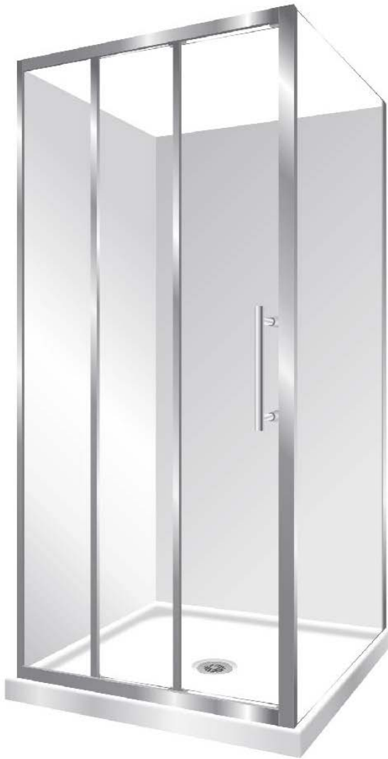
Pictured Above - Orion Square 1000x1000 3 Panel Stacker Door Silva Flat Wall