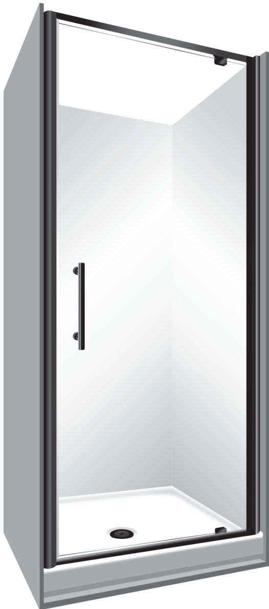
Pictured -Stellar 900 pivot door flat wall black SKU 364961