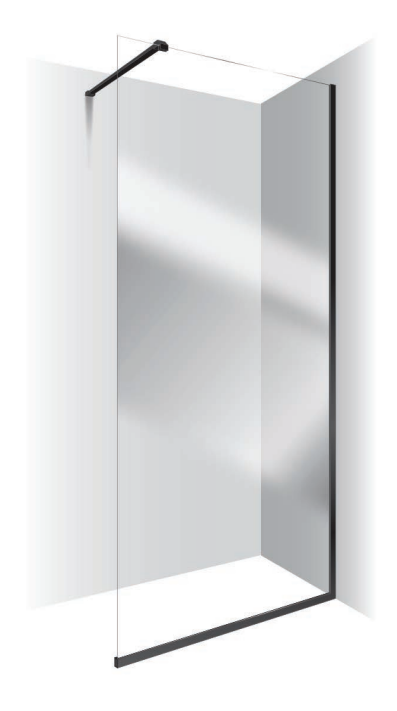
Pictured - Frameless 1000mm Walk In Panel Black SKU 353339