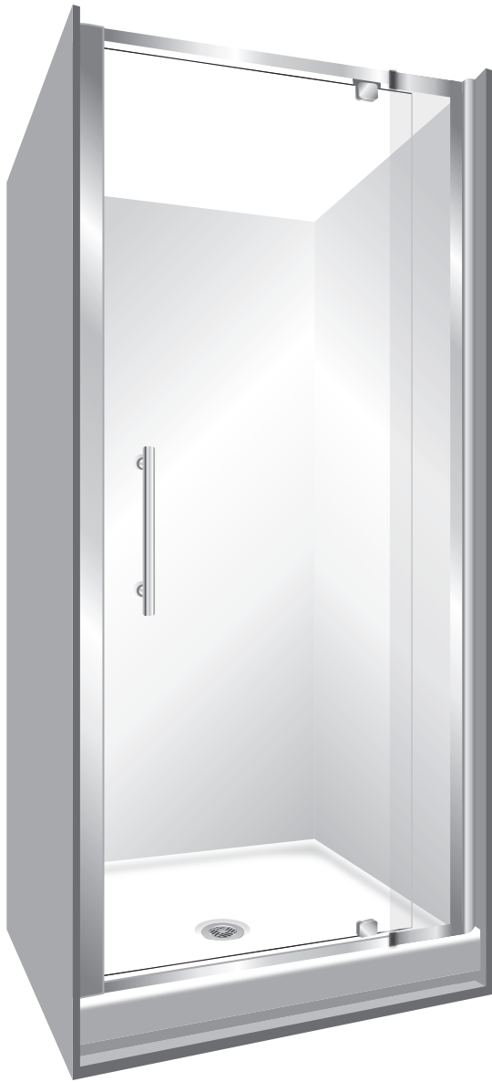
Pictured -Retro 900 Pivot Door Flat Wall Silva SKU RA900SIFW18