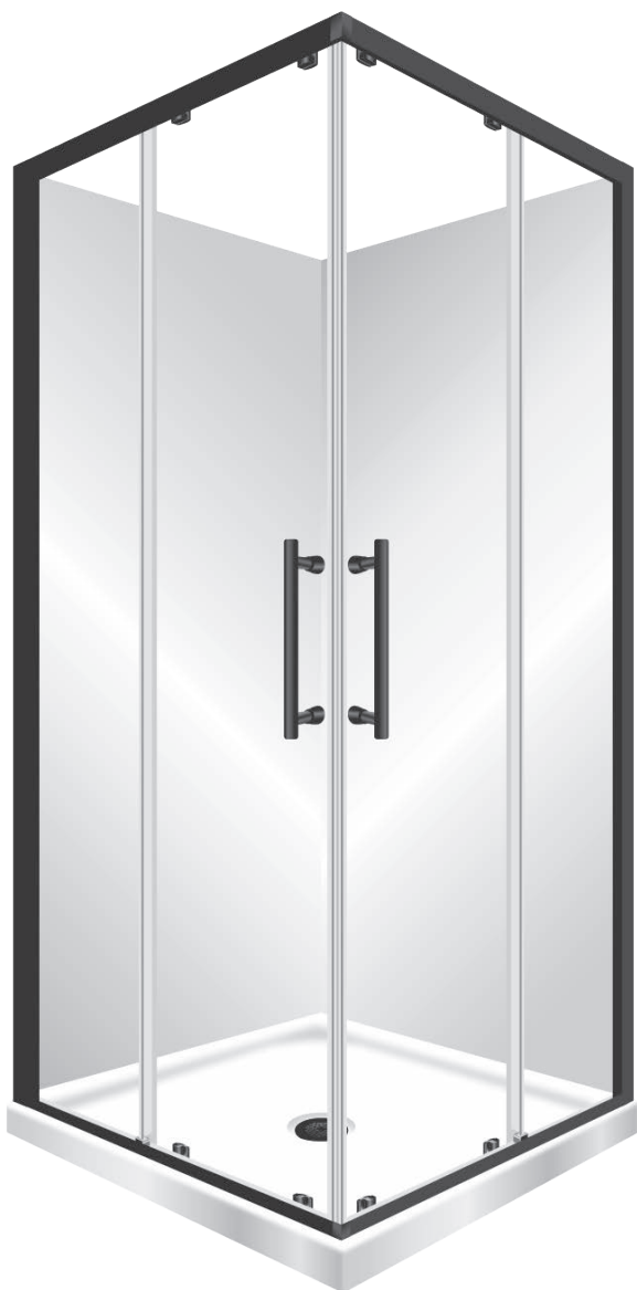
Pictured above - Twin 90 900 x900 black flat wall SKU 364967