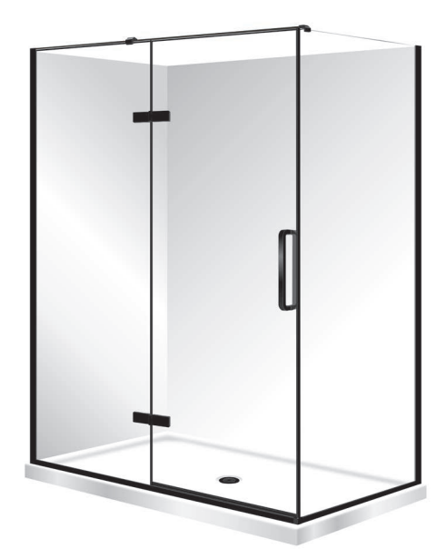
1200x1000 LH Flat Wall Black Centre Waste