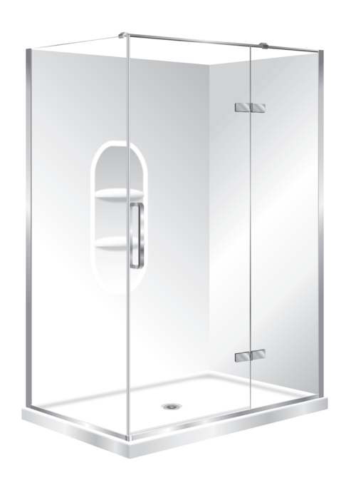
1200x900 RH Flat Wall Silva Centre r Waste