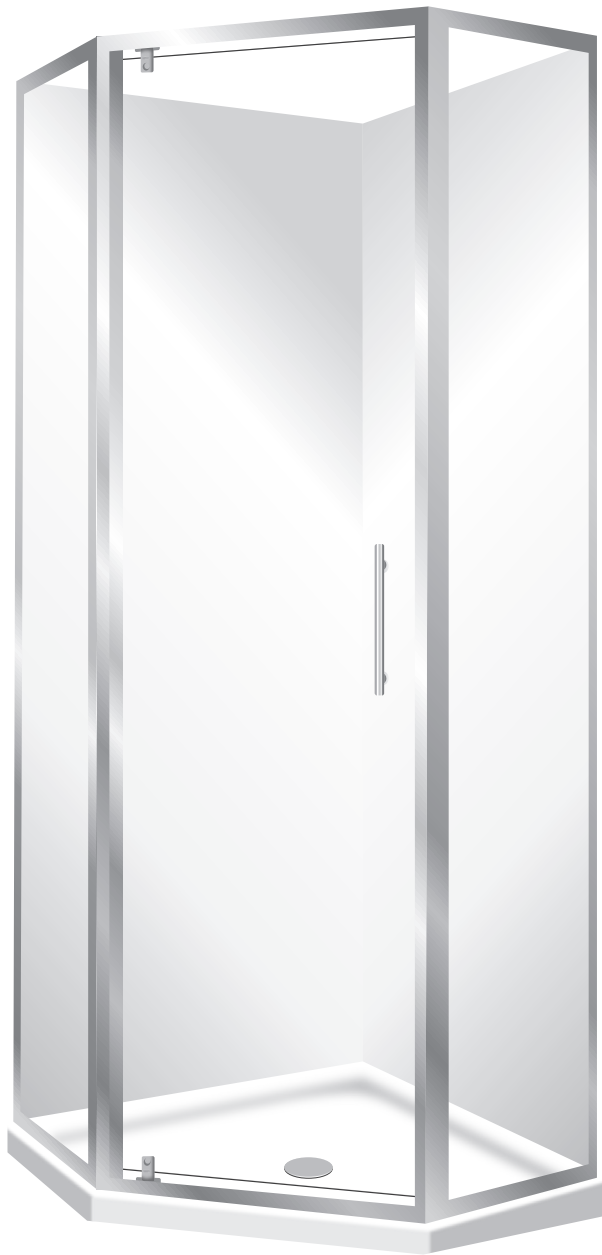
Pictured above - Stellar angle corner 9x9 silva flat wall SKU 248513