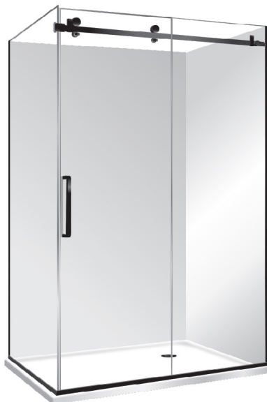
Pictured Above - Stellar Luxury 12x9 RH Black Door Flat Wall SKU 318634