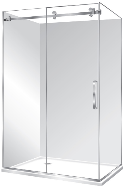
Pictured Above - Stellar Luxury 12x1 LH Silver Door Flat Wall SKU 242920