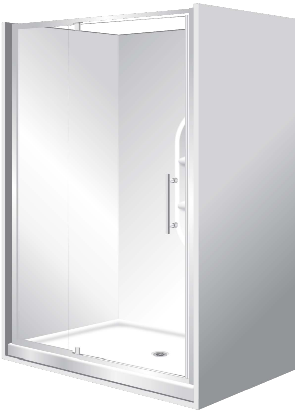
Pictured above - Capricorn 900x1200x900 alcove white pivot door moulded wall SKU 248520