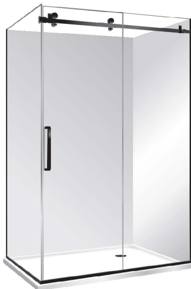
Pictured Above - Stellar Luxury 12x9 RH Black Door Flat Wall SKU 318634