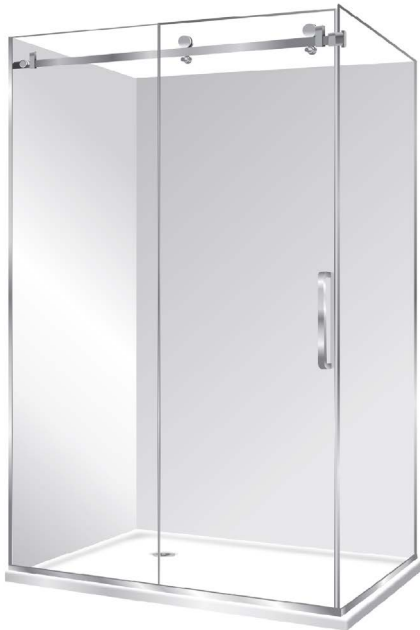
Pictured Above - Stellar Luxury 12x1 LH Silver Door Flat Wall SKU 242920