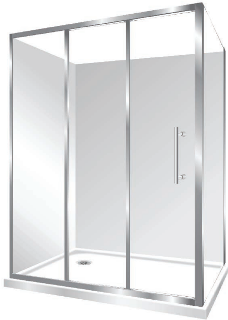
Pictured - RETRO 1200 X 900 mm Left Hand Tray Orientation Silva Flat Wall