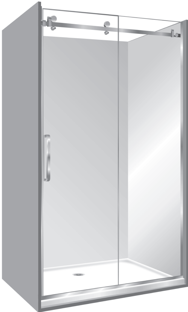
Pictured Above - Stellar Luxury 1x12x1 Alcove Silva Door Flat Wall Right Hand Opening Door SKU 248559