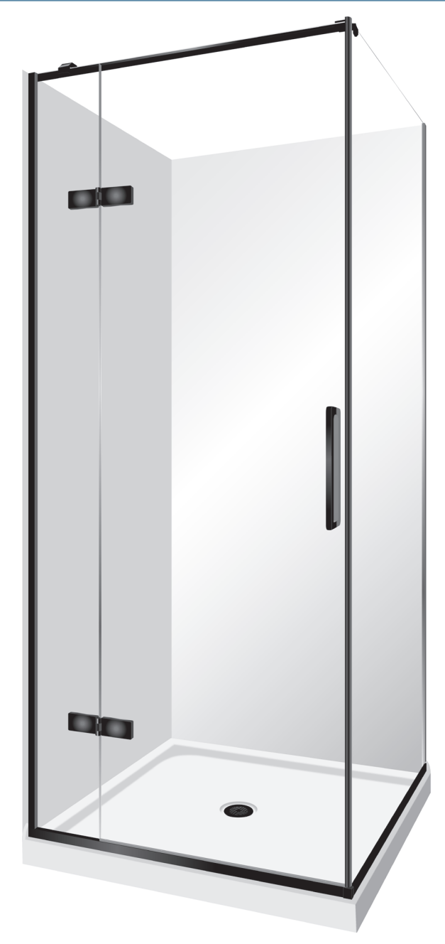
Pictured - 900 x 900 Flat Wall Black