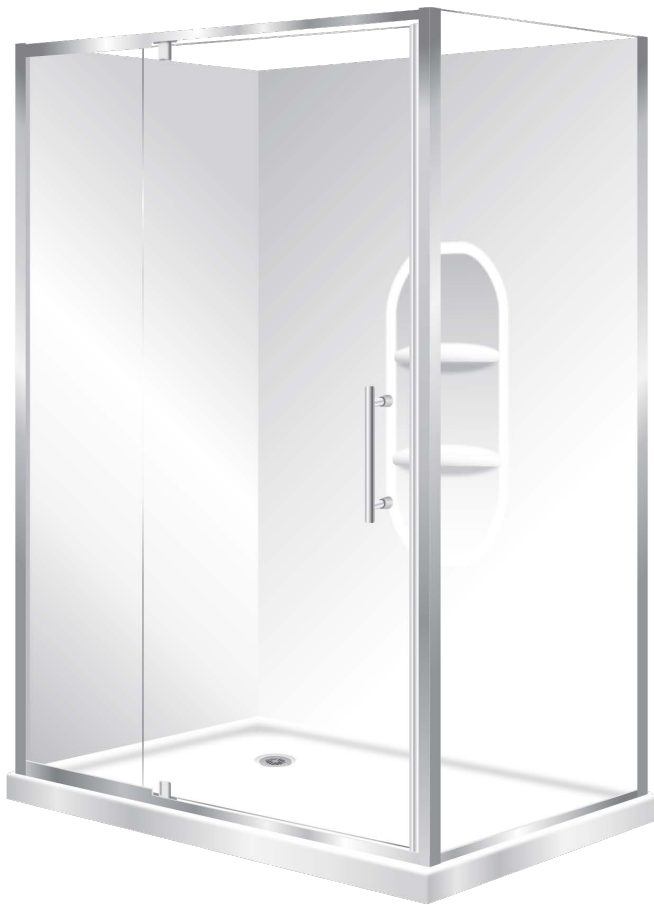
Pictured Above - Stellar Capricorn Left Hand Orientated Tray Silva Door, Moulded Wall