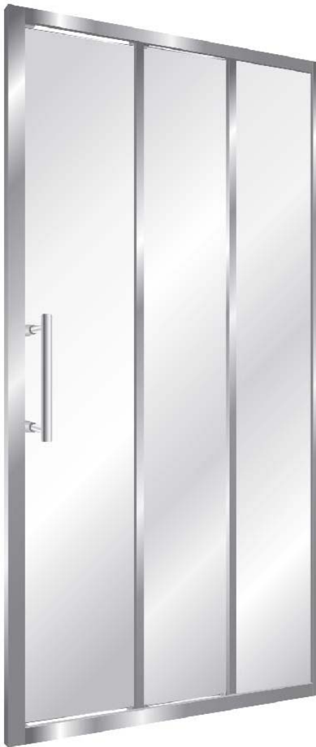
Pictured above - Stellar 3 Panel Stacker Door Silva