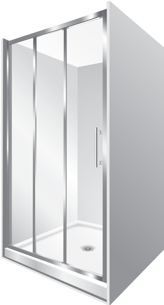
Pictured above - Stellar 900 x 900 3 sided alcove flat wall silva SKU 248574