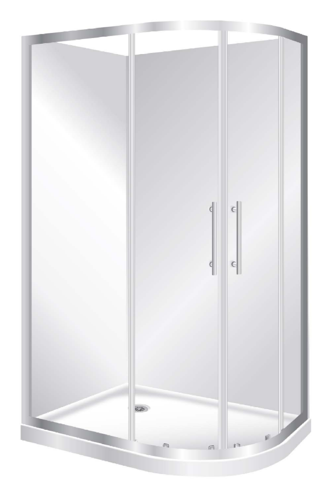
Pictured Above - Stellar 12 x 9 Round Corner LH Flat Wall Silva SKU - RR12X9SIFWLH18