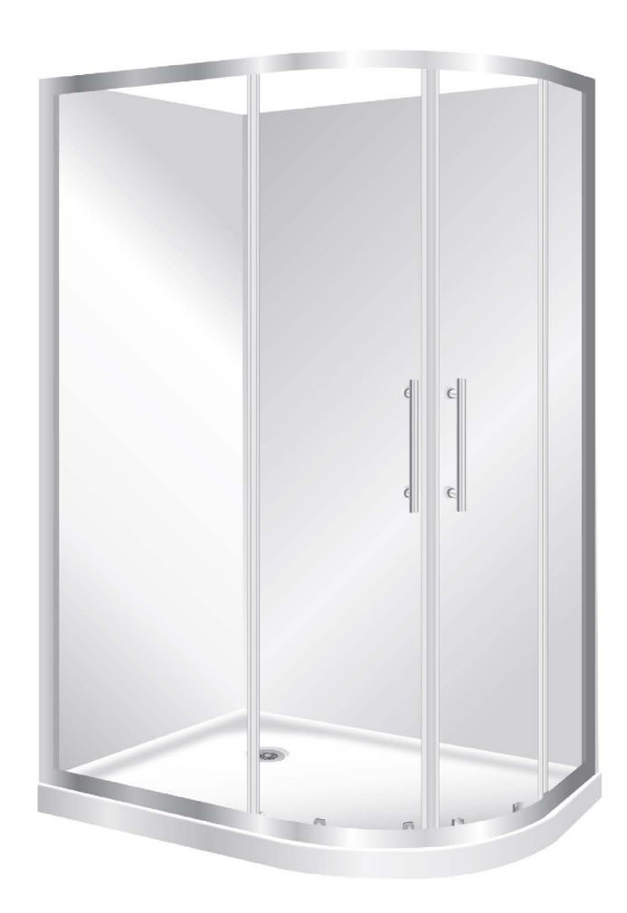
Pictured above - Round 1200 x 800 LH silva flat wall SKU 293708