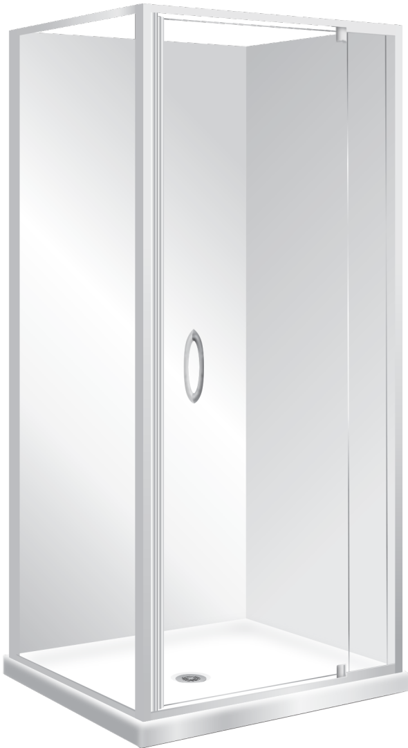
Pictured Above - SQUARELINE 1x1 Square Corner SKU 228924