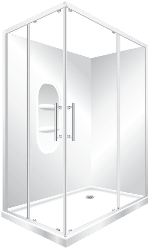
Pictured above - Stellar Twin 90 1200 x 900 RH white door moulded wall SKU 326914