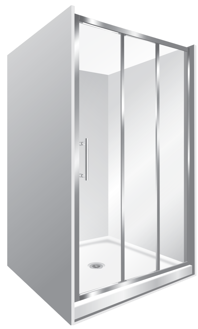
Pictured above - Retro 900 X 1200 X 900 alcove 3 panel stacker flat wall silva