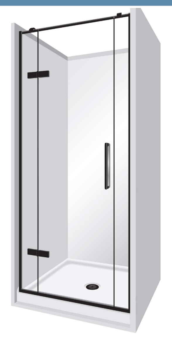
Pictured -900 x 900 x 900 Alcove Black