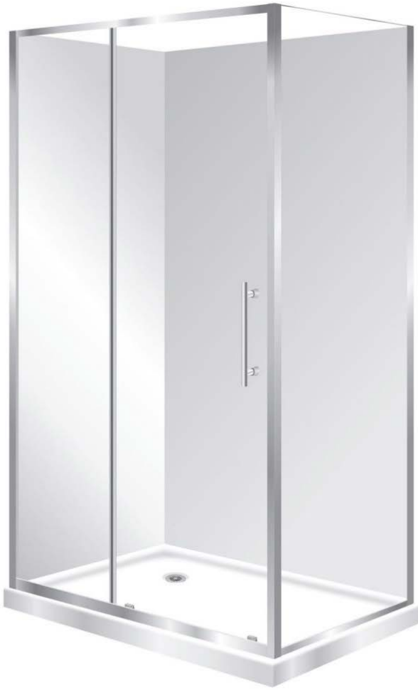
Pictured - Stellar Capricorn 12x8 Left Hand Tray Orientation 2 Panel Slider, Silva Door, Flat Wall SKU 295466