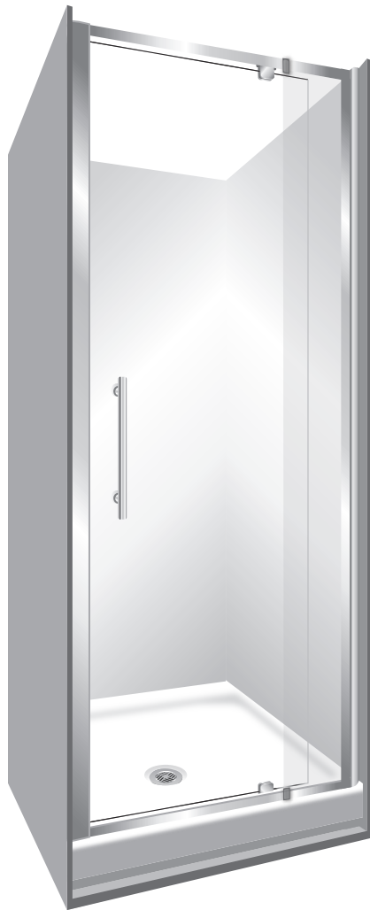
Pictured above - RETRO 900x1200x900 alcove silva pivot door flat wall SKU RA9X12X9SIFW18